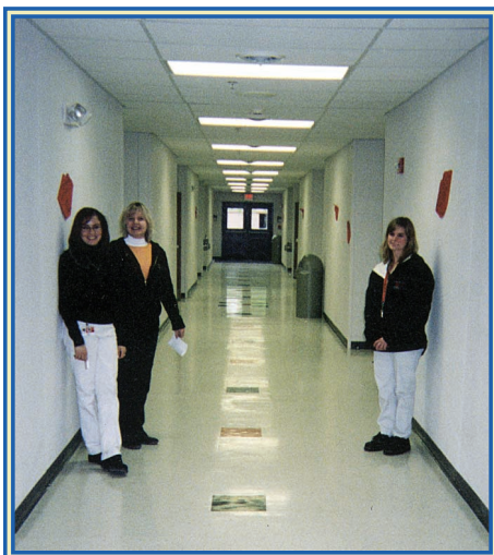
Admiring new wing – Teachers at Wheaton admire their new classrooms, totaling 35,000 square feet.

"We've been building school classrooms, offices, athletic storage facilities and press boxes for decades. We're the experts in meeting quality, timelines and budget requirements," Darnell said. ■