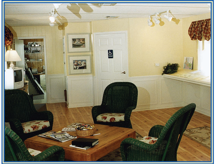
Interior welcome – Cherry Hill Village’s real estate office looks as alluring as the homes themselves.

The Cherry Hill Village office, embellished with awnings, surrounded by white picket fences and