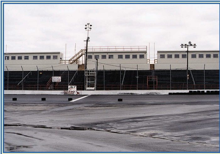
Hear all about it . . . Toledo Speedway press box construction was rapid – like the vehicles zooming ‘round its oval track.

The three press boxes at the Toledo Speedway, won mention for design and creativity, as well as speed of delivery. Within two months the units were ordered and installed, demonstrating how rapidly McDonald Modular could solve space needs with attractive facilities. The crane operator said that he enjoyed lifting and placing these buildings on top of the grandstands because they were “the best built” modular buildings that he had ever hoisted. ■